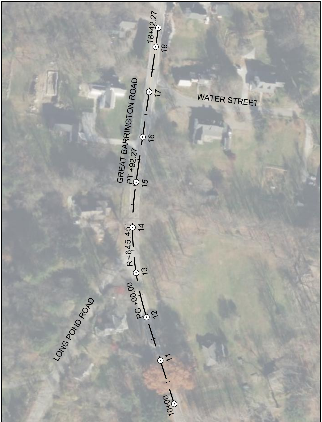
Great Barrington Road - Horizontal Curve at Long Pond Road Great Barrington Road (Route 41) West Stockbridge, Massachusetts