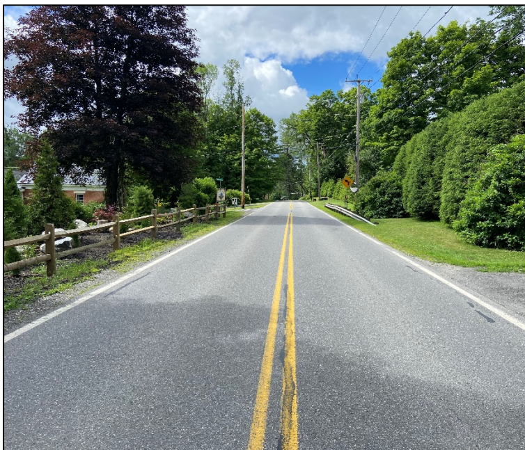
Great Barrington Road, looking south near Water Street