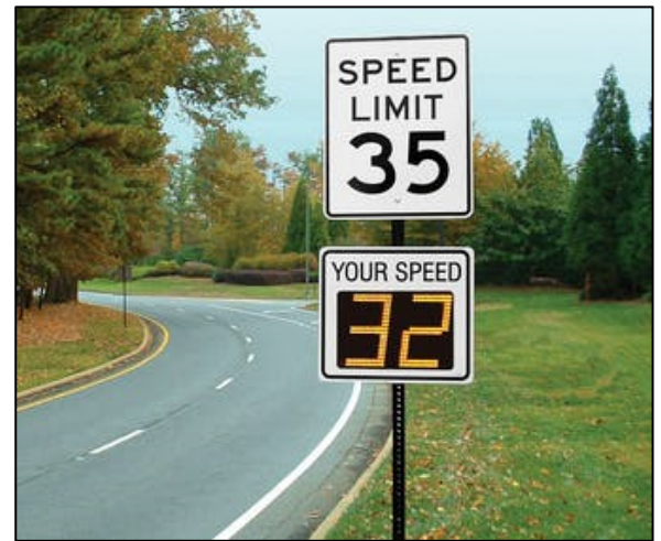
Speed feedback sign

Electronic speed feedback signage could be installed along Great Barrington Road to display a vehicle's speed for comparison with the posted speed limit. These signs can be installed below the existing speed limit signs along Great Barrington Road or installed with new speed limit signs at locations where the speed limit is not currently posted, such as long tangent sections of Great Barrington Road where speeding may be most prevalent. Studies have shown that drivers tend to reduce their speed when made aware that they are driving over the speed limit.