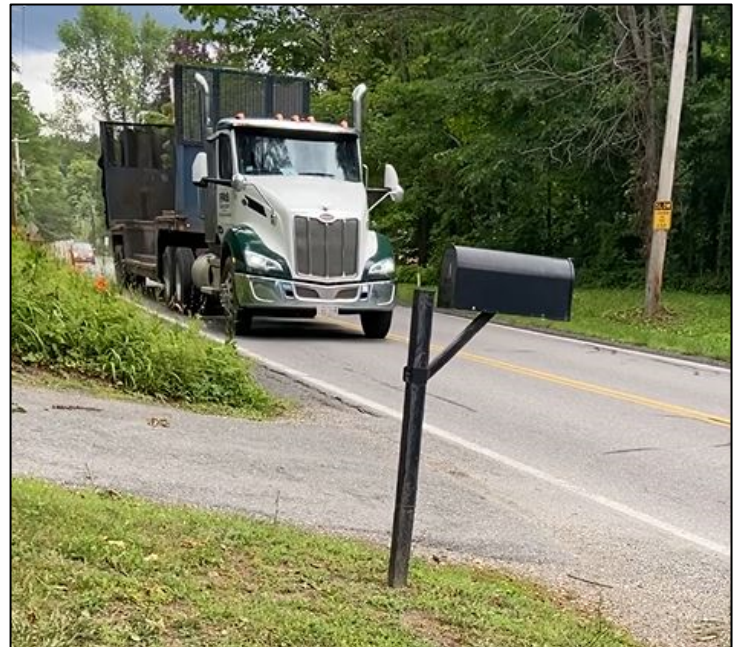
Truck observed along Great Barrington Road