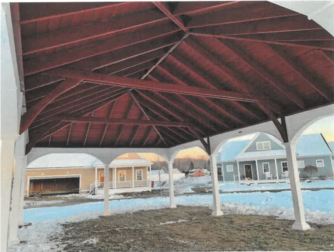
Large Pavilion Exterior